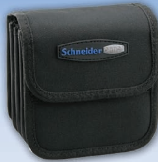
Century Essential-5 Filter Kit with multi-compartment pouch

Employs a surface that is 50% clear and 50% with a neutral density of 0.6. The shift from clear to ND is achieved with a SOFT EDGE (SE) transition line. The ND .6 Soft Edge Graduated Filter balances exposure within a scene – for example, the exposure of sky and earth in a landscape, avoiding overexposed blank white skies.