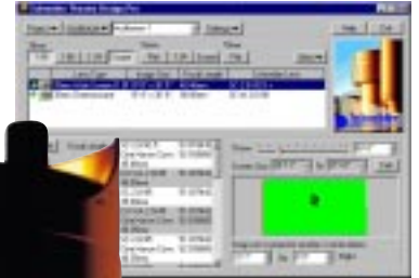
Theatre Design Pro Software

Before you settle for inferior, overstated projection lenses, look at the expanded Schneider Super-Cinelux line. You'll clearly see why we lead the industry in quality, performance and sales, every step of the way. Contact us for more information on the world's most complete line of 35mm and 70mm lenses -- in focal lengths from 24 to 180mm -- plus magnifiers, minifiers and converters.